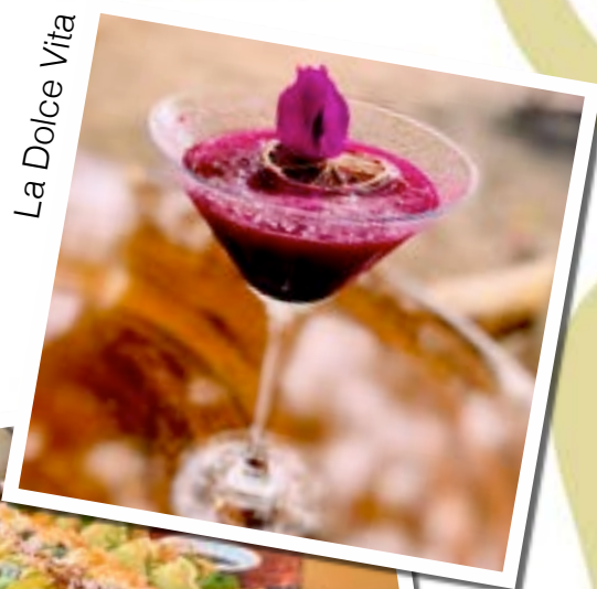
La Dolce Vita